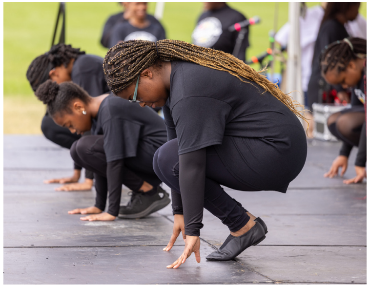
Juneteenth: Celebrating Black Excellence