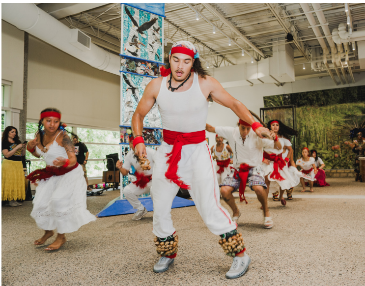
Latino Conservation Week Festival