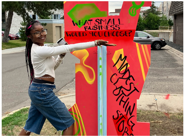
Small Business Center engagement, Juxtaposition Arts installation