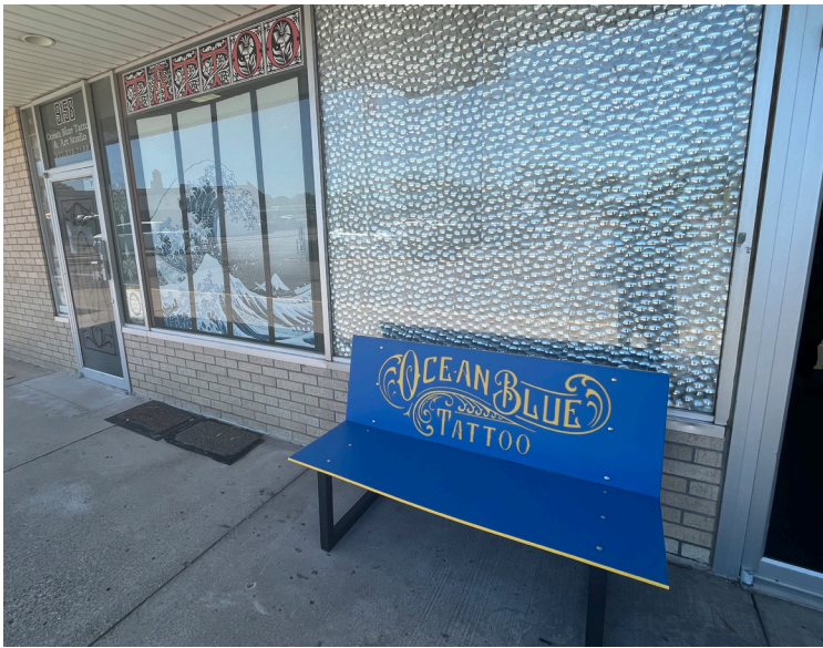
Old Shakopee & Old Cedar placemaking, custom bench.