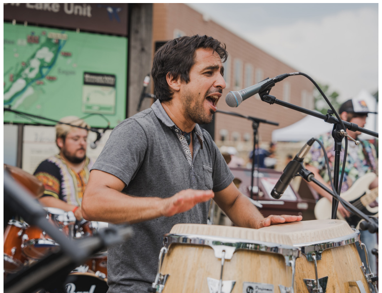
Latino Conservation Week Festival, photo credit: Drew Arrieta