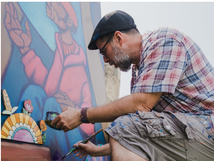
Latino Conservation Week Festival, mural in progress by Pablo Kalaka.