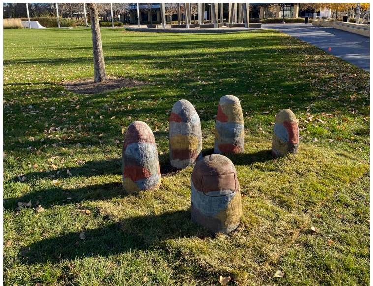
"The Beacon of Unity," by Safa Sarvestani and Shirin Ghoraiishi.