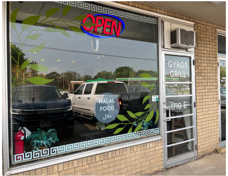
Old Shakopee & Old Cedar placemaking, custom window decals.