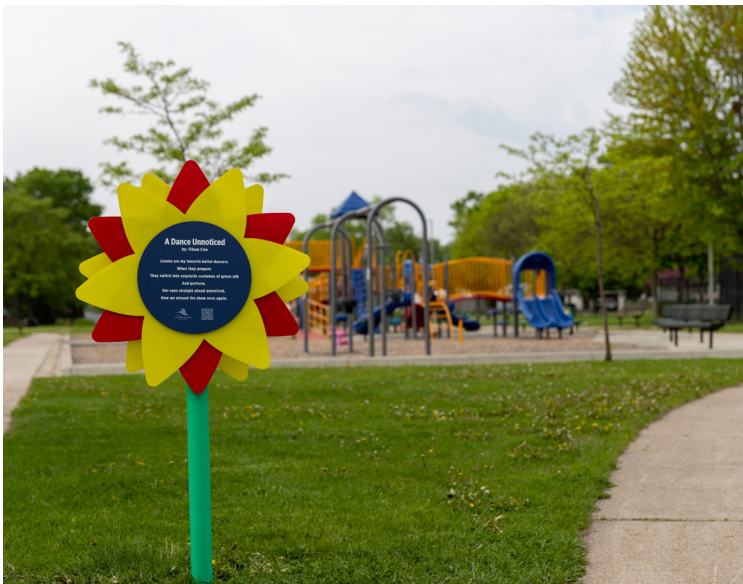
Hometown Poetry Sign