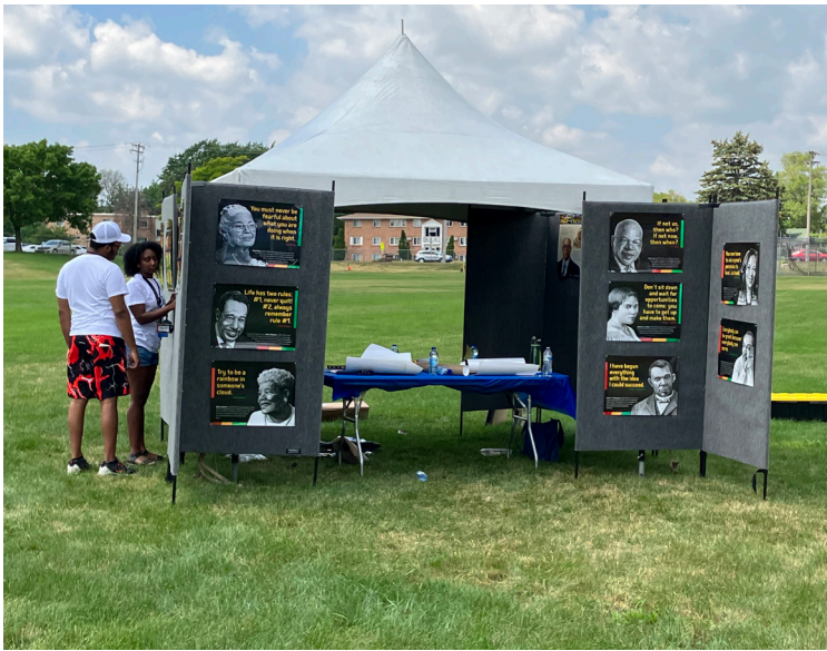
Juneteenth: Celebrating Black Excellence