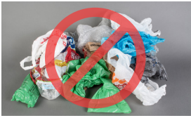
Plastic bags and film

The following items cannot be recycled and only add to the contamination in our recycling.