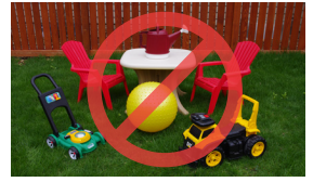
Large plastic items and toys