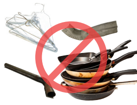
Random metal items