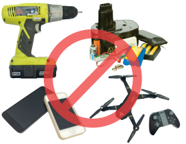
Electronics and batteries