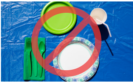
Paper plates, cups, napkins, straws, and utensils