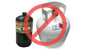
Pressurized cylinders (propane, helium, CO2)

Drop-off recycling options exist for some of these items. Check the Hennepin County Green Disposal Guide at hennepin.us/green-disposal-guide