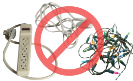
Tanglers like electrical cords, holiday lights, and hoses