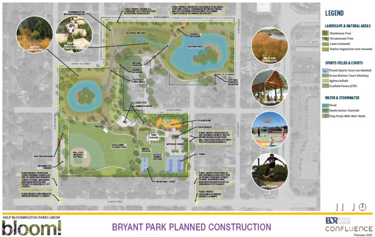
Graphic: Planned Construction at Bryant Park