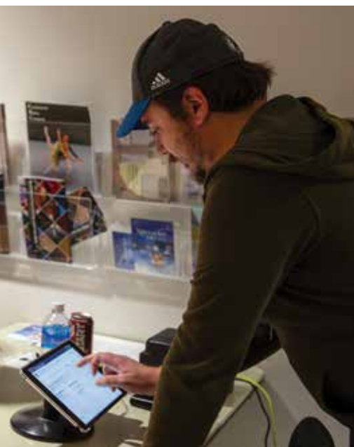
An election judge helps voters at the polling place at Civic Plaza.

Voters are allowed to register at their polling place on Election Day. To register, you must provide proof of residence. Learn more about how to register at your polling place by visiting blm.mn/voting .