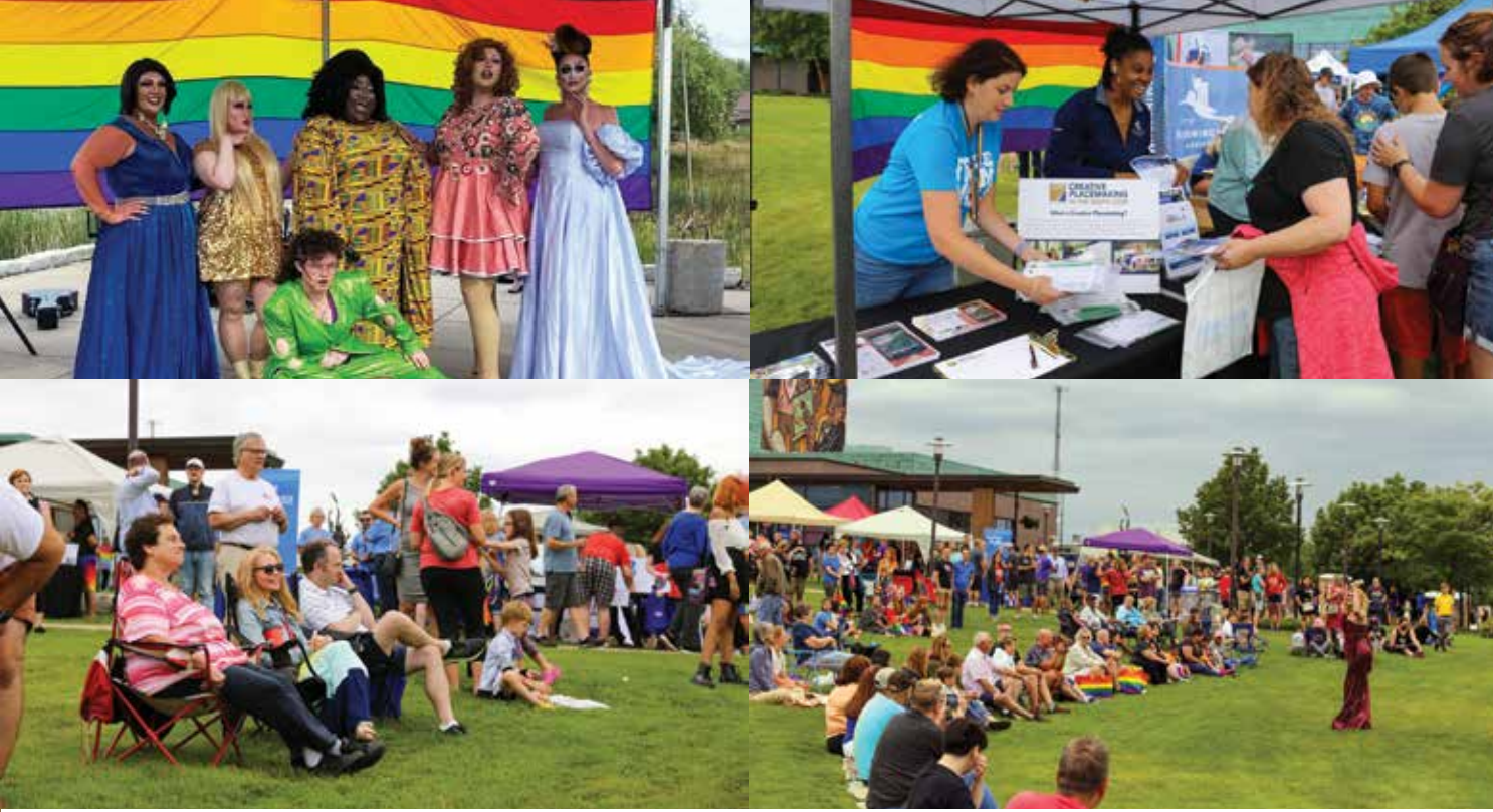
People in attendance and performers at the 2023 Bloomington Pride celebration.