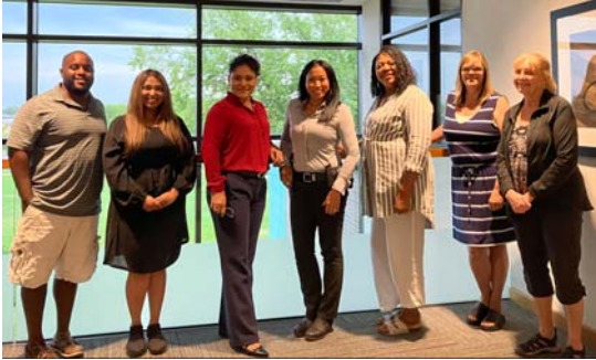
Pictured: the Welcome to Bloomington Design Group

By organizing personalized introductions to city staff, businesses, community organizations, fellow residents, and essential amenities, new residents can quickly establish connections and create community.